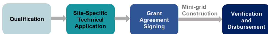
Figure 2. Process for the REA NEP Performance-Based Grant

The PBG also comprises a two-stage process. At qualification stage, developers submit a programme application to demonstrate eligibility. Second, qualified developers are invited to submit site-specific technical applications, with details on the site, generation and distribution designs, and targeted number of connections per project. This of course depends on a critical assessment of the sites’ suitability for mini-grid connection. The bidders must verify that the